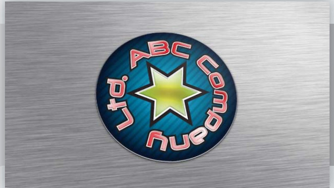
final circular vinyl sticker with spot gloss varnish